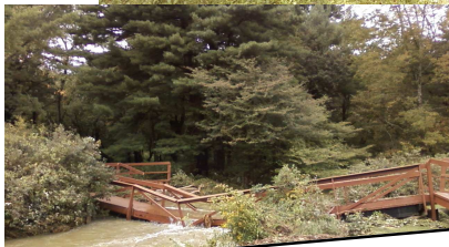
LARGE FOOTBRIDGE TO WALKING TRAILS SNAPPED IN TWO AND TORN FROM IT'S FOOTINGS BY RUSHING WATER.