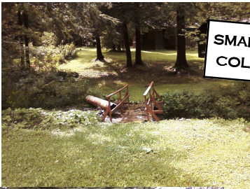
SMALL FOOTBRIDGE NEAR THE COLLINS CONROY LODGE